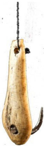
A bone fish hook circa 1930

ANT015877