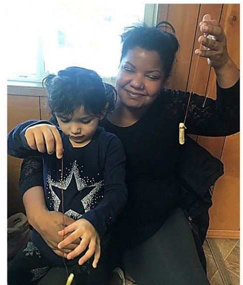
Finished Fish Hooks