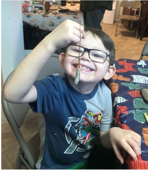
A finished fish hook