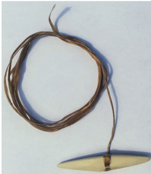
Toggle or Gorge Hook, Osgood 1937:101